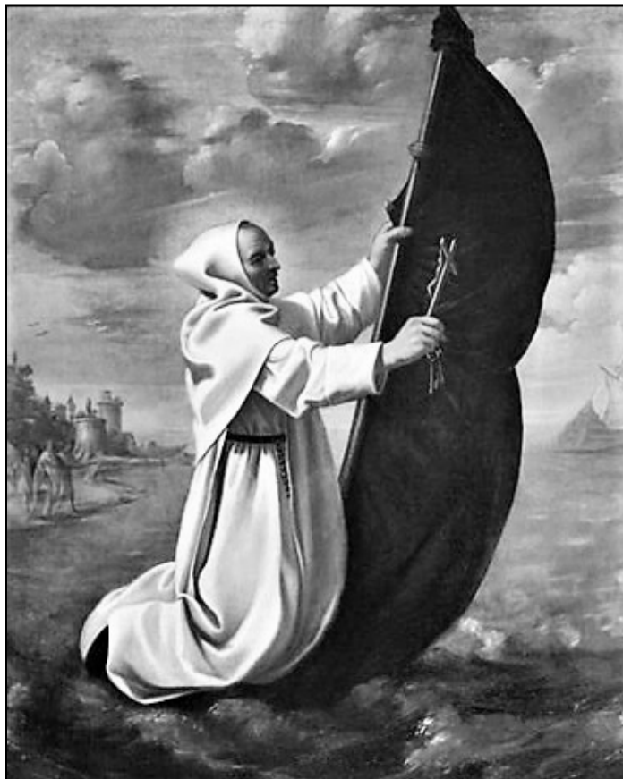
Painted by Ecole Francaise

Saint Raymond of Peñafort was a Spanish Dominican friar and a lawyer for the Church. He is the patron saint of canon lawyers, or lawyers who work with the laws of the Church. His family had ties to the royal house of Aragon, and he studied law in Barcelona. He helped Peter Nolasco gain permission to found the Mercedarians, an order dedicated to Our Lady of Mercy. He founded a school to help Dominicans learn foreign languages so they might free Christian captives in foreign lands, and he wrote a book teaching confessors how to best serve in their priestly role during this Sacrament. An amazing miracle happened when he was stranded on the island of Majorca, and the king would not allow him to leave. Saint Raymond went to the sea, spread his cloak on the water, holding the other end up with his walking stick. He sailed 160 miles to Barcelona while sailors in boats urged him on, and many onlookers watched at the shore when he arrived on the mainland! This miracle touched the King's heart, and he mended his ways. His feast day is January 7th. Saint Raymond of Peñafort, pray for us!