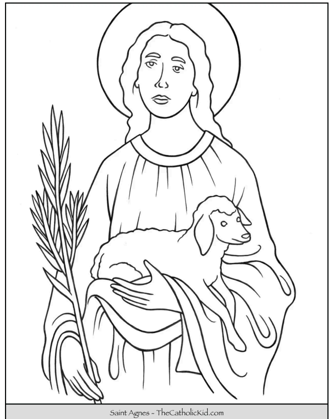
Saint Agnes - TheCatholicKid.com