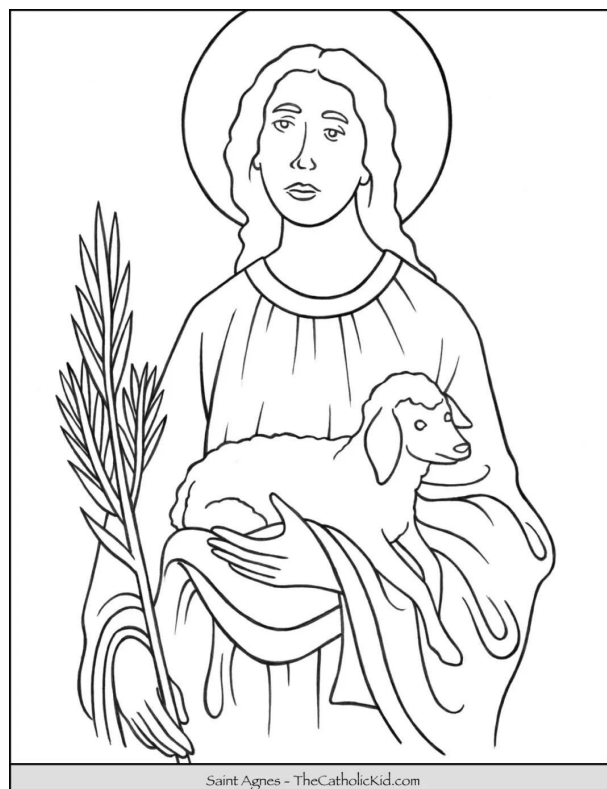
Saint Agnes - TheCatholicKid.com