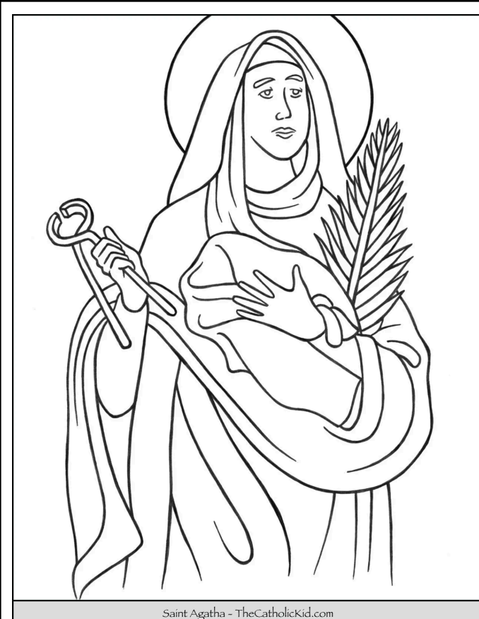
Saint Agatha - TheCatholicKid.com

Holy siblings and holy families change the world!