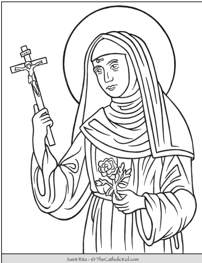
Saint Rita

Saint Rita of Cascia lived in Italy during the last part of the 14th century and the first part of the 15th century. She was first a wife and mother but later became a nun after her husband died. St. Rita was virtuous, disciplined, and always devoted to God even though she faced many hardships. She wanted to suffer as Christ did and upon asking Him in prayer for this wish, she received a wound on her forehead like the crown of thorns that lasted until her death. Her prayers were often answered, and she remains a faithful and efficacious intercessor today. Her body, after her death, was discovered to be incorrupt and can be found today at her shrine in Cascia, Italy. She is the patroness of impossible cases, challenges in marriage, and parenthood. We celebrate the feast of Saint Rita on May 22. Saint Rita, pray for us!