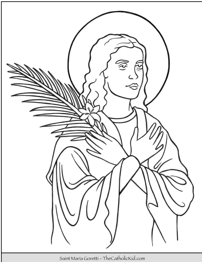
Saint Maria Goretti