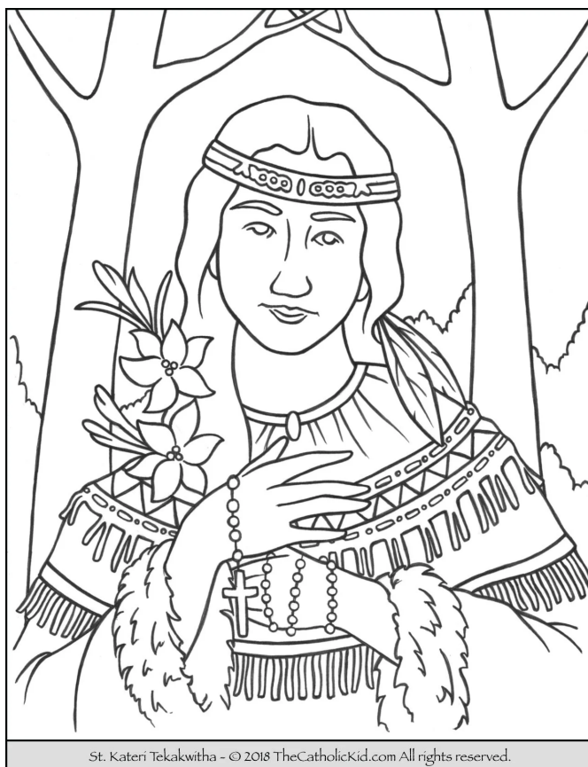
St. Kateri Tekakwitha