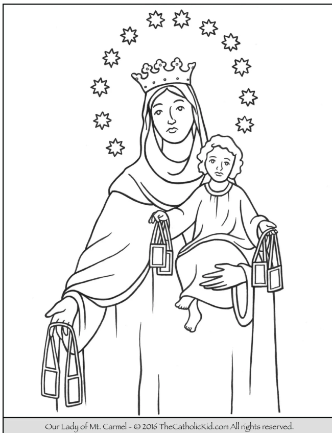
Our Lady of Mt. Carmel