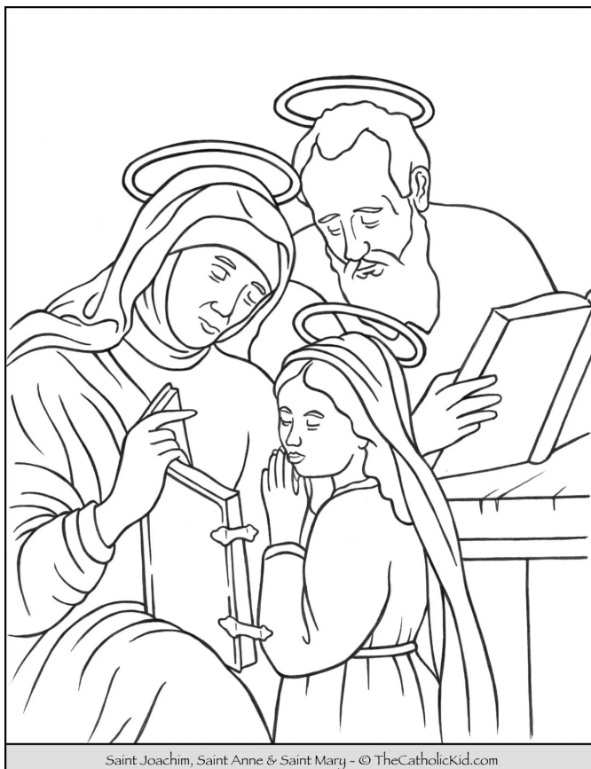
Saint Joachim, Saint Anne & Saint Mary