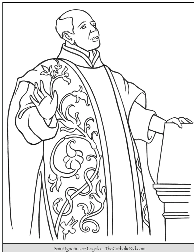
Saint Ignatius of Loyola - TheCatholicKid.com

Saint Ignatius of Loyola was a 16th century Spanish priest. He lived a worldly life until a war injury ended his military career. While he was healing, the only books he had access to were about Jesus and the saints, and this led to his conversion. He gave up all his worldly possessions and eventually founded the Society of Jesus or the Jesuits, who were disciplined to combat heresy to instead spread the truth of the Gospel. The Jesuits did missionary work in non-Christian countries, and Saint Ignatius lived the rest of his life near Rome where he helped many people in need. We celebrate the feast of Saint Ignatius on July 31. Saint Ignatius of Loyola, pray for us!