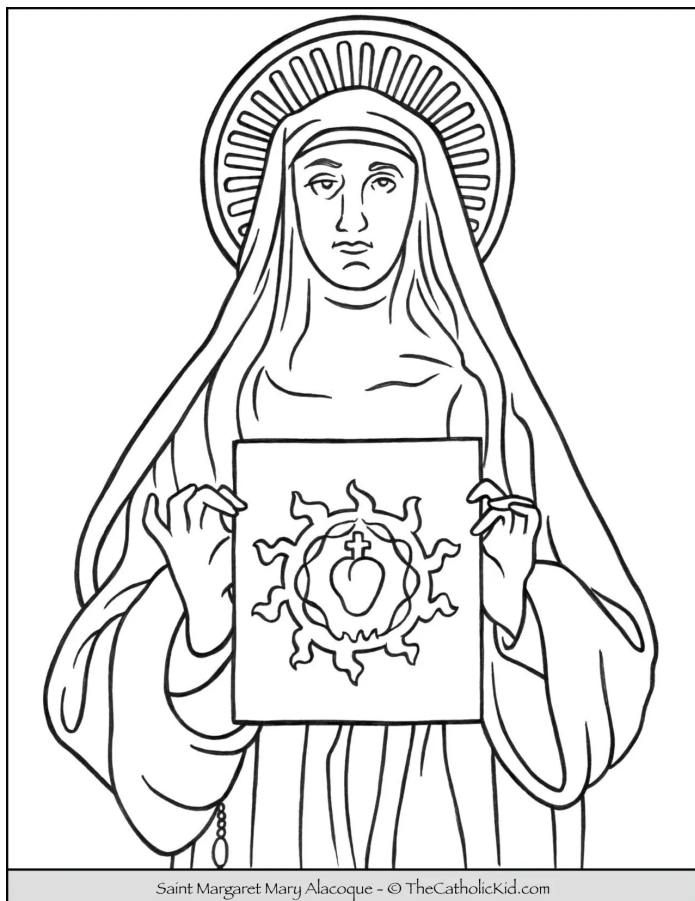
Saint Margaret Mary Alacoque