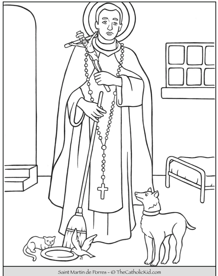
Saint Martin de Porres

- Pope John XXIII, St. Martin de Porres Canonization Homily