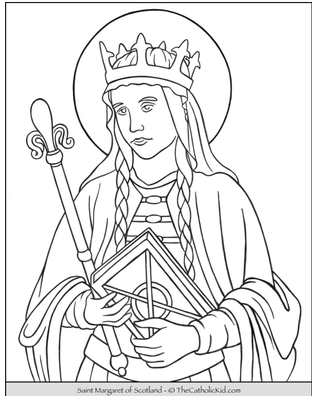
Saint Margaret of Scotland