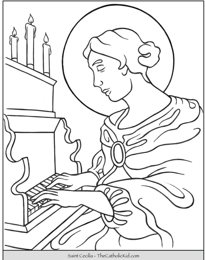
Saint Cecilia - TheCatholicKid.com