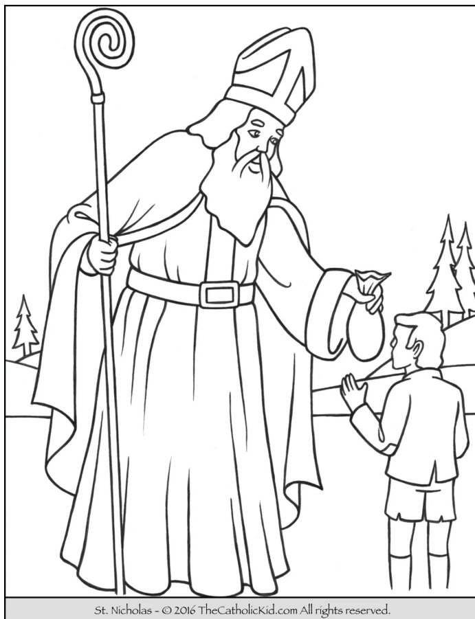
St. Nicholas