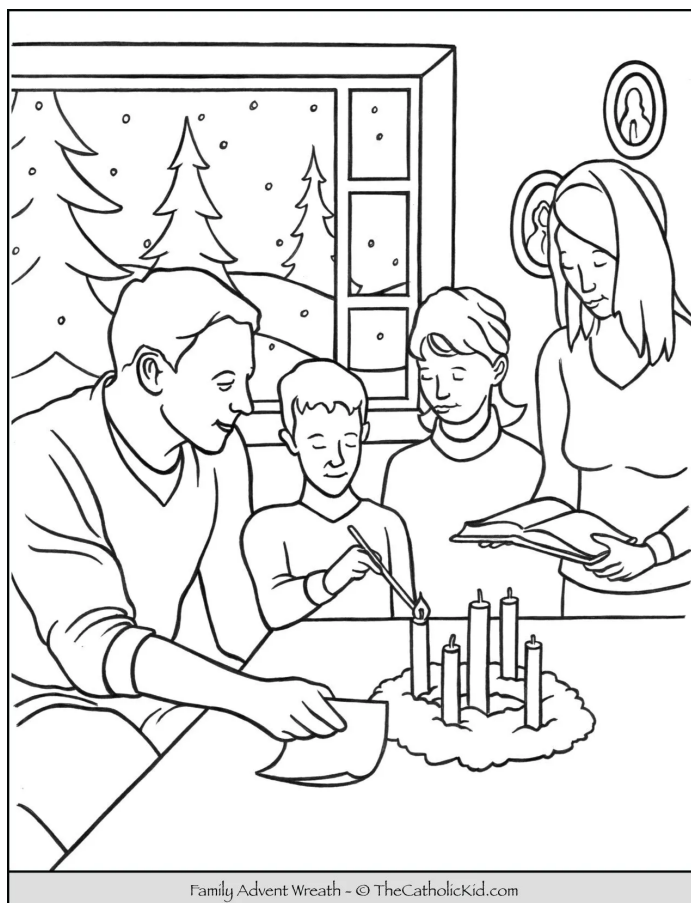
Family Advent Wreath

Advent is a time of penance, of turning away from sin and hopeful, joyous preparation for the coming of the Savior. This is what makes Advent special for Christians: the recognition that Christmas is not just “the birthday of Jesus,” but a celebration of his coming into our world today, here and now. How does he come into the world today? Jesus is “born”—becomes physically tangible—through the celebration of the sacraments. It is by eating the Eucharist, washing in the waters of Baptism, being anointed with the oil of Confirmation and so on, that Jesus’ friends become part of the living Body of Christ (the Church) in the world today. For Catholics, then, every celebration of the Eucharist and the other sacraments is like a little Christmas. During Advent, Christians prepare for this here-and-now coming of Christ by remembering the long years during which Israel waited for the coming of the Messiah, and by looking forward to the final coming of Christ at the end of time. You will hear both themes reflected in the Church’s readings during Advent. How does your family prepare during Advent?