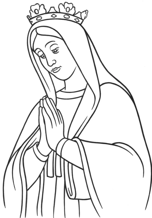
Saint Mary Praying

Today's Responsorial Psalm is Mary's Magnificat. Read Mary's prayer and color her picture.