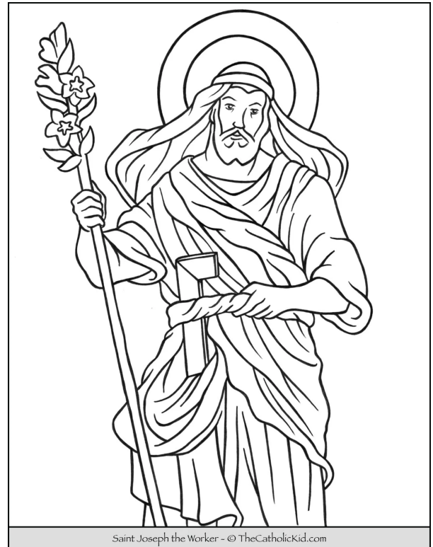
Saint Joseph the Worker