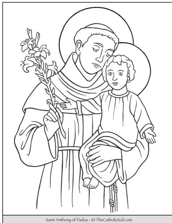
Saint Anthony of Padua

Saint Anthony of Padua was born in 1195 in Lisbon, Portugal. At 15, he devoted himself to study in the Monastery at Coimbra. St. Anthony was seized with a desire to become a martyr when he first encountered the remains of St. Bernard and companions recovered from Morocco and set off for Africa. But being a martyr was not God's plan and St. Anthony found his way to Italy, where it was discovered that this humble priest was a speaker filled with the Holy Spirit. A man who lived the poverty of the Gospel, he soon attracted the attention of people who would wait hours to hear him speak. Once a man came upon the saint & found him holding in his arms the Child Jesus, surrounded with heavenly light. For this reason St. Anthony is often depicted holding the Child Jesus. In 1231, he died at 36 years old. He was declared a saint the following year and in 1946 was declared a Doctor of the Church. Saint Anthony of Padua, Pray for us! (ref. EWTN)