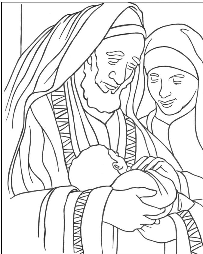
Zechariah, John and Elizabeth - TheCatholicKid.com

With water balloons? Learn about fun traditions practiced around the world...and new ones you can do as a family! (Formed, 3 min. 39 sec.)