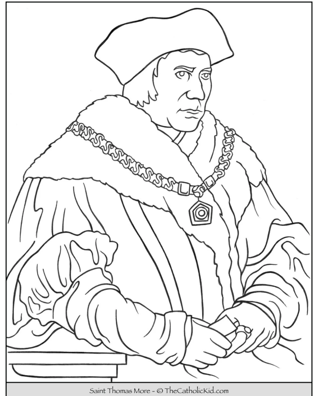
Saint Thomas More

Born in 1478, Saint Thomas More is most widely known for his steadfast refusal to support King Henry VIII's divorce & remarriage and the king's establishment of the Church of England. For this, he was beheaded on Tower Hill in 1535. In his final statement, he said he was "the king's good servant, but God's first", underscoring his refusal to deny his Catholic faith. More was canonized in 1935 and in 2000, Saint Pope John Paul II made him patron of political leaders. "The supreme diplomat and counselor, he did not compromise his own moral values in order to please the king, knowing that true allegiance to authority is not blind acceptance of everything that authority wants." He is also the patron saint of lawyers and public servants. His feast day is June 22. Saint Thomas More, pray for us! (ref. FranciscanMedia.org)