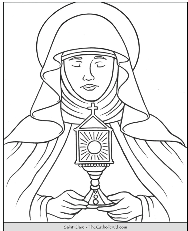
Saint Clare - TheCatholicKid.com

This epic feature film on the lives of St. Clare and St. Francis was shot on location in Italy. We celebrate St. Clare's feast day on August 11.