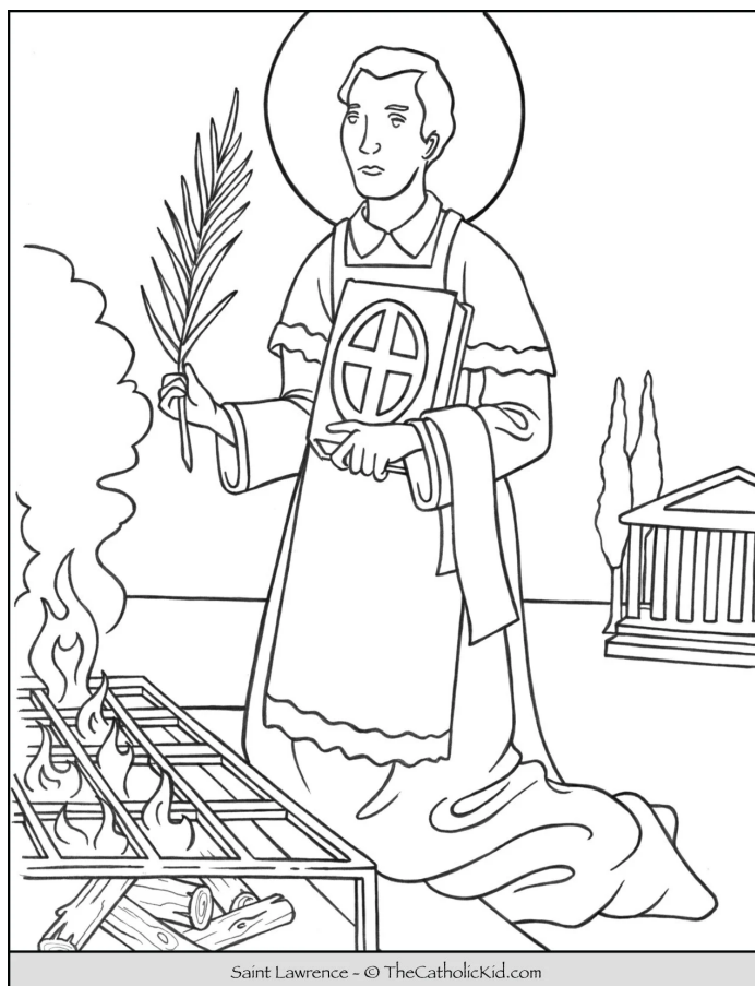
Saint Lawrence