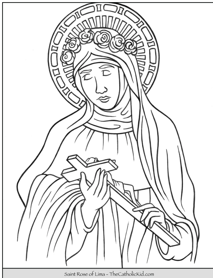
Saint Rose of Lima - TheCatholicKid.com