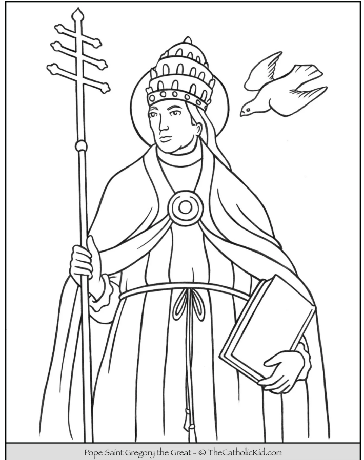
Pope Saint Gregory the Great