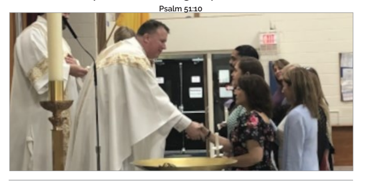
Please visit each program's web page for details

Create in me a clean heart, O God, and put a new and right spirit within me.