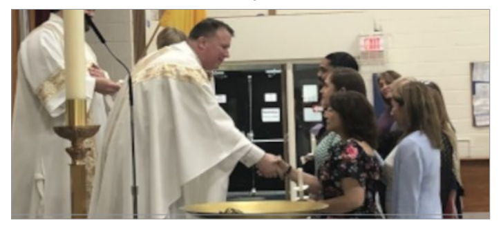
Please visit each program's web page for details

Create in me a clean heart, O God, and put a new and right spirit within me. Psalm 51:10