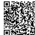
Managing My Giving