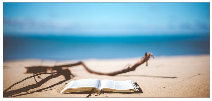
See program details, dates, times, locations and contacts at stambroseva.org