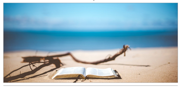
See program details, dates, times, locations and contacts at stambroseva.org

Create in me a clean heart, O God, and put a new and right spirit within me. Psalm 51:10