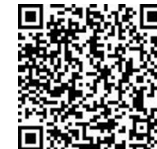
Managing My Giving