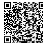
Managing My Giving